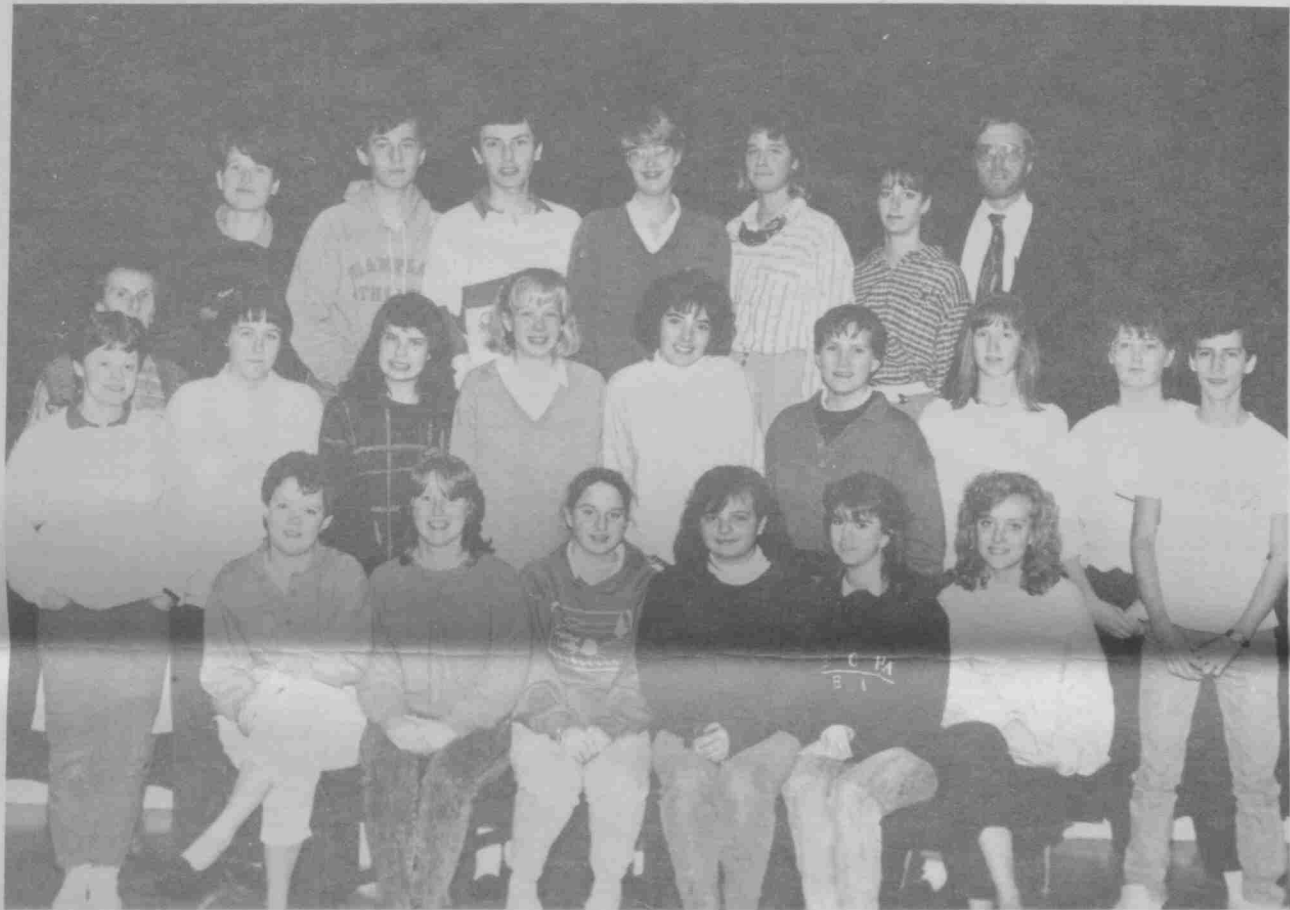
The Students Above are the Students Involved in the German Exchange Program Mentioned in our Last Issue.

three different letters of the alphabet. Break the code and read the message.